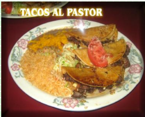
TACOS AL PASTOR