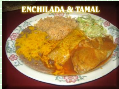
ENCHILADA & TAMAL